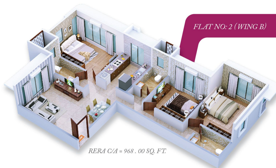
FLAT NO: 2 (WING B)