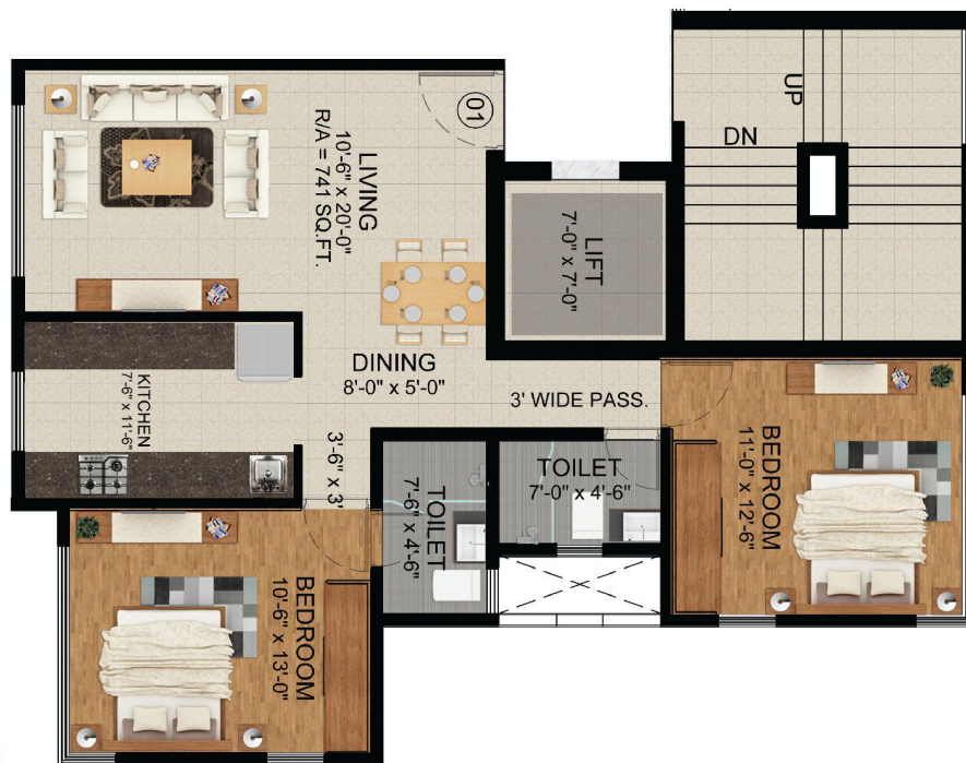
FLAT NO: 1 (WING A)