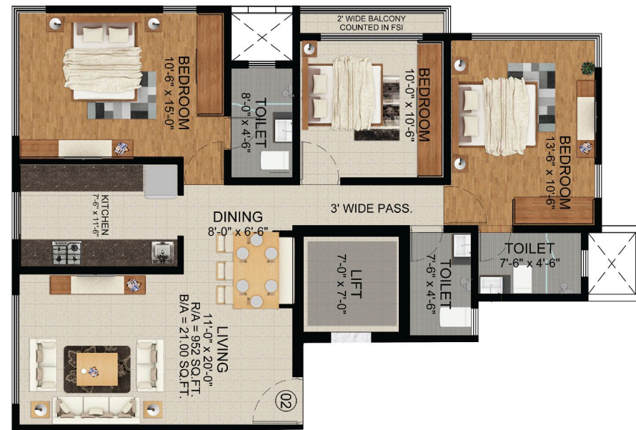
FLAT NO: 2 (WING A)