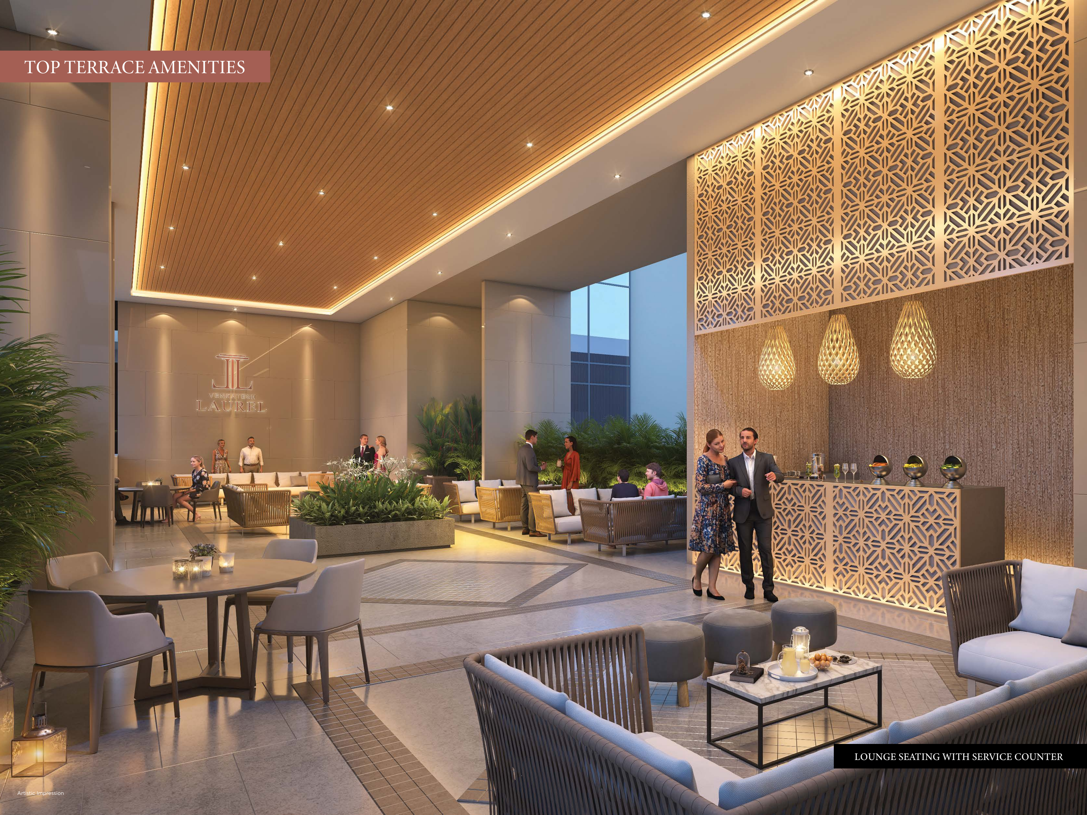
LOUNGE SEATING WITH SERVICE COUNTER